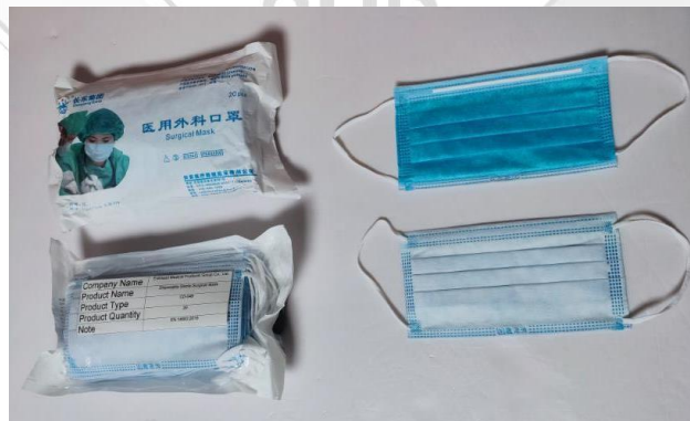
Photo of Samples